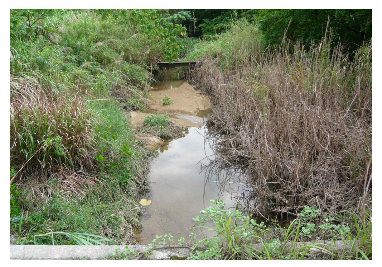
WATERCOURSE (UPPER STREAM OF W1)