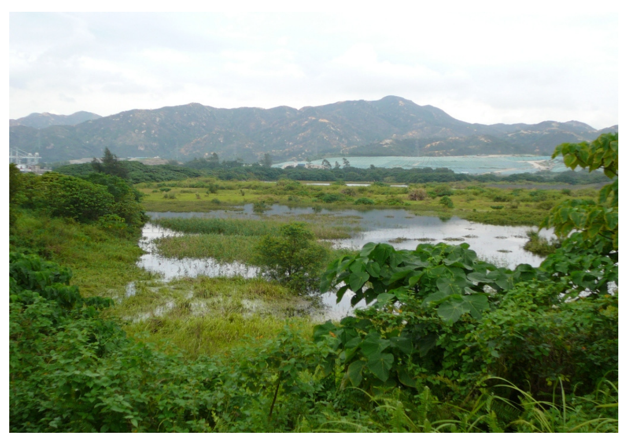
ASH LAGOON (EAST LAGOON)