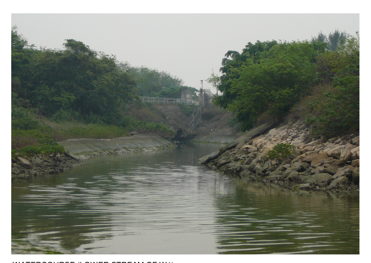
WATERCOURSE (LOWER STREAM OF W1)