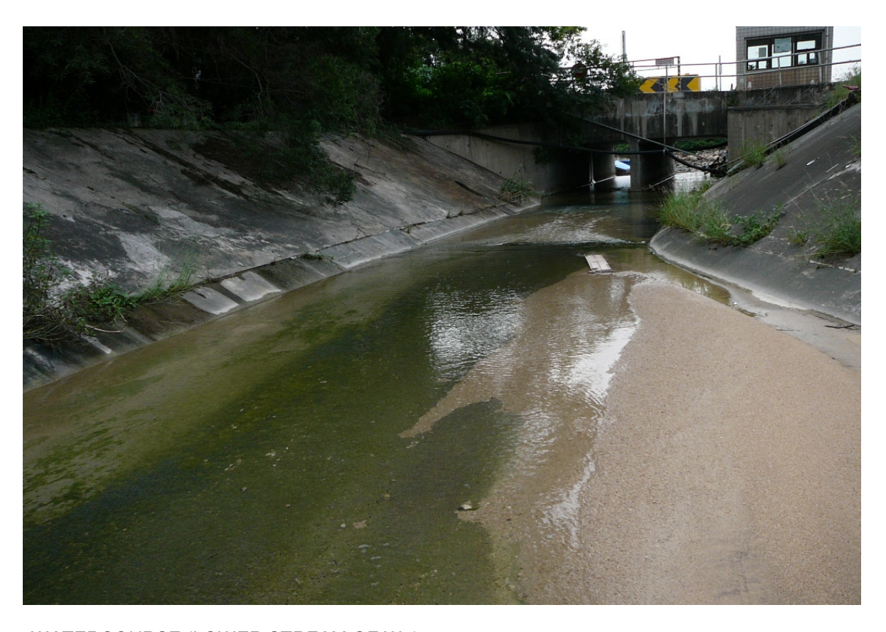
WATERCOURSE (LOWER STREAM OF W2)