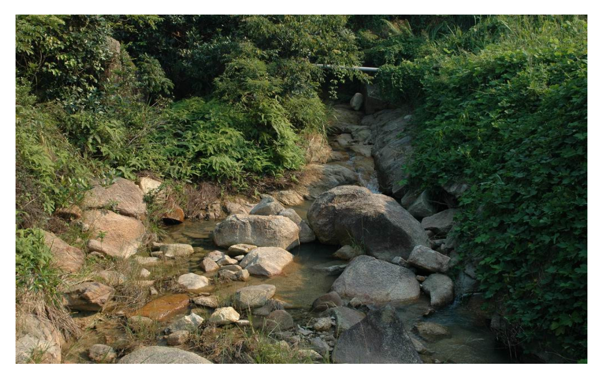
WATERCOURSE (UPPER STREAM OF W2)