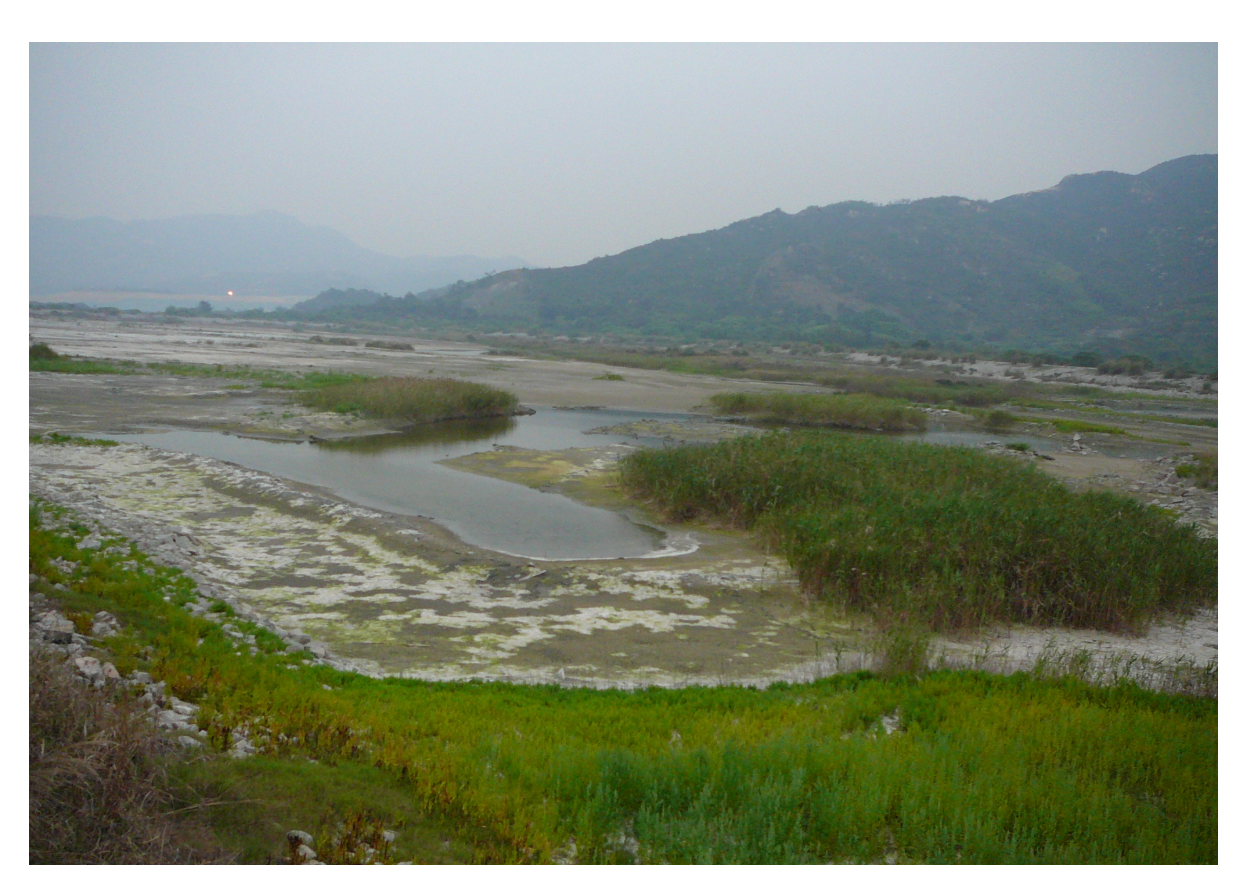
ASH LAGOON (MIDDLE LAGOON)