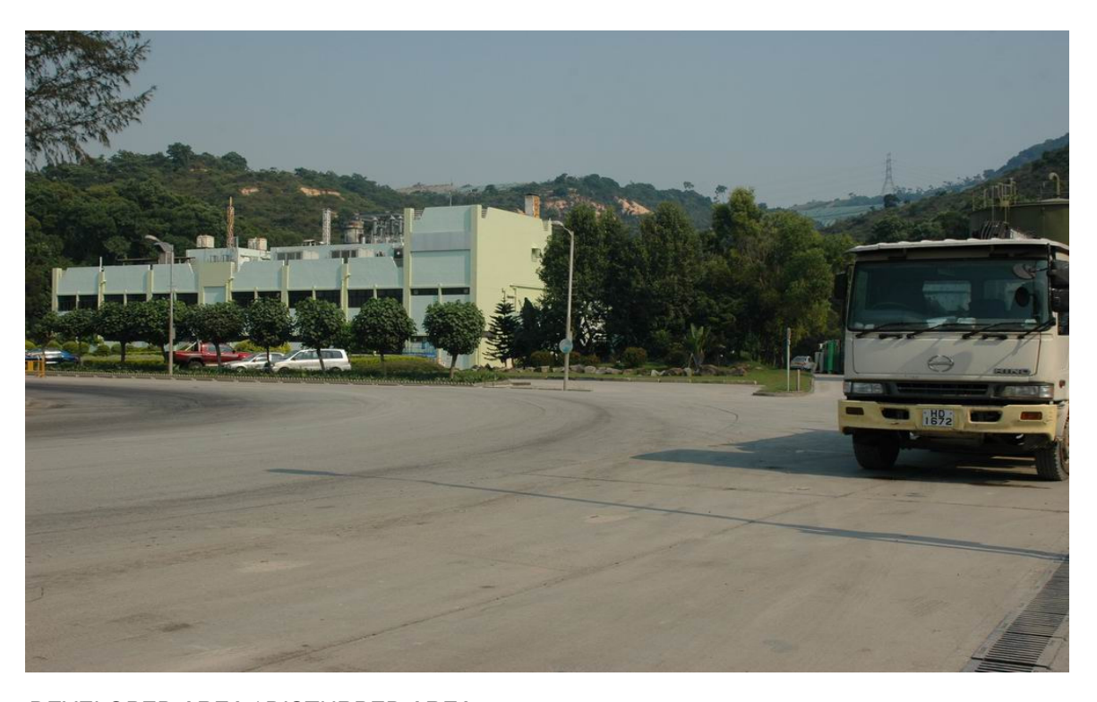
DEVELOPED AREA / DISTURBED AREA